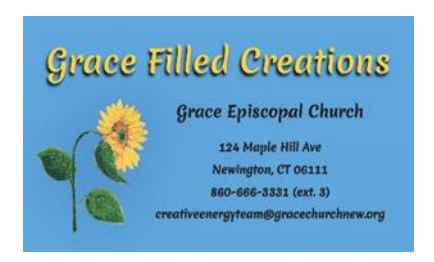
Creative Energy Team December 2017