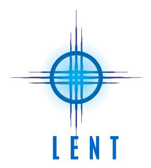
Feb. 25, Mar 11, 18 and 25 – Potluck and Lenten study, 6pm Parish hall